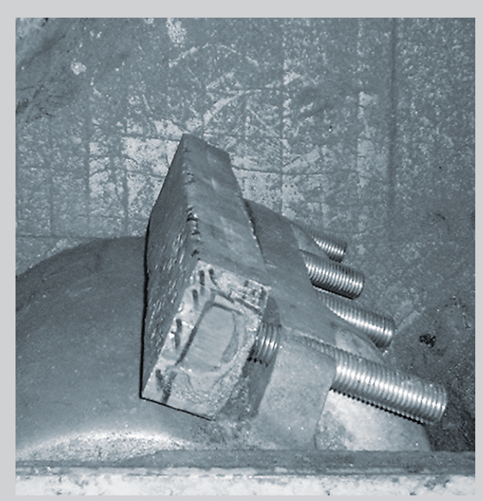
Glass recycling; impact crusher for crushing of ceramics