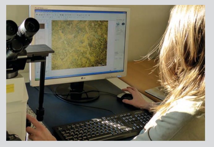
VAUTID wear research laboratory: Quality control

VAUTID has been ISO 9002 certified since 1993 and ISO 9001 certified since 1996. All VAUTID deposition welding materials, composite wear plates, and casting products are developed, tested and produced in accordance with these strict quality requirements. This guarantees a consistently high standard for all VAUTID premium products.