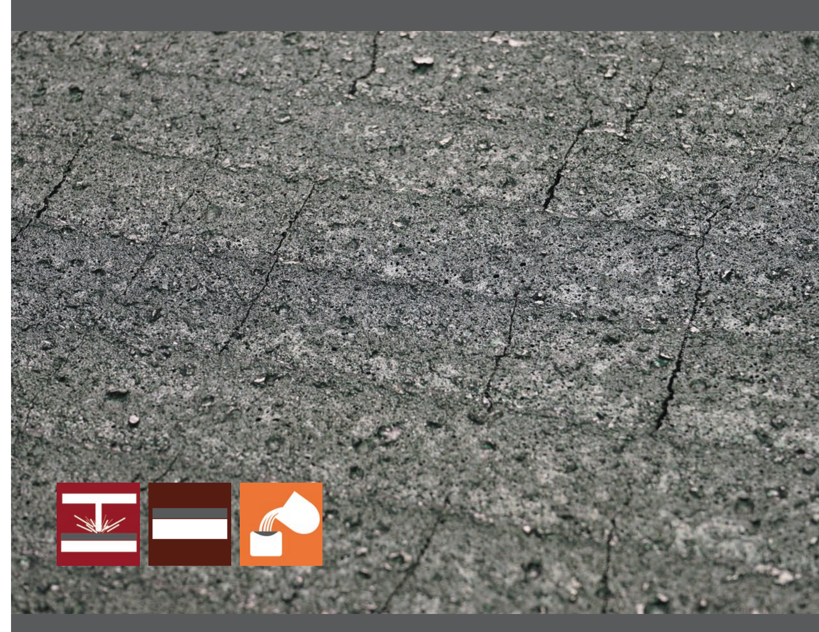
Pioneering Wear Protection