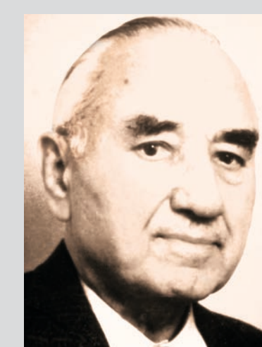
The founder and pioneer of metal-based wear protection was Dr. Hans Wahl

VAUTID consulting and design. Our goal is to develop the best solutions for reducing wear in original equipment operation and maintenance of systems and machines. To achieve this goal, VAUTID engineers analyze your requirements, prepare a fail-safe diagnosis and design a custom solution for protecting wear-exposed parts. The right VAUTID materials are selected to ensure optimum protection against wear, corrosion or heat. VAUTID uses its expertise to cut wear costs and maximize the service life of the equipment.