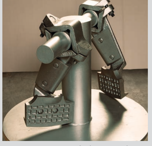
\label{lem:prop:control} \textit{VAUTID wear resisting casting for the concrete industry}