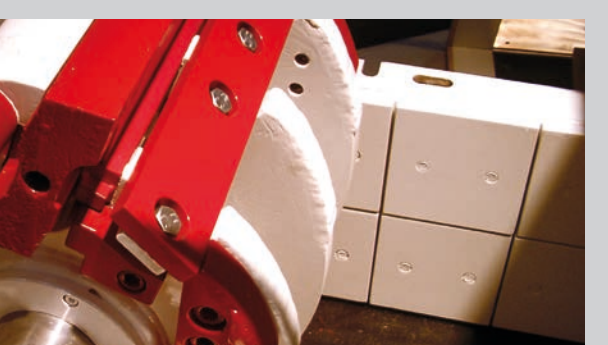
Impact bars for crushers