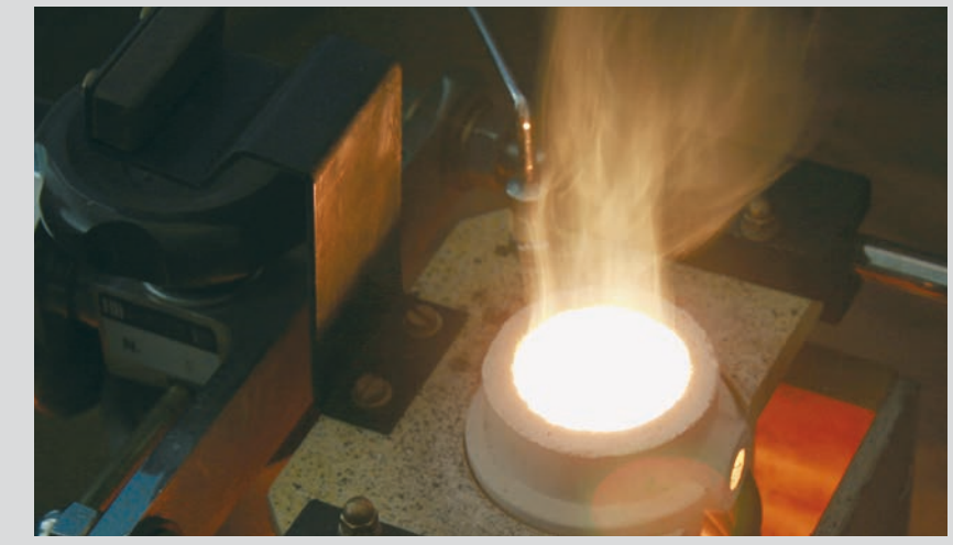
VAUTID casting process

VAUTID is an experienced partner in component manufacturing for high carbon and stainless steel casting. VAUTID cast products are manufactured and processed in accordance with customer specifications.