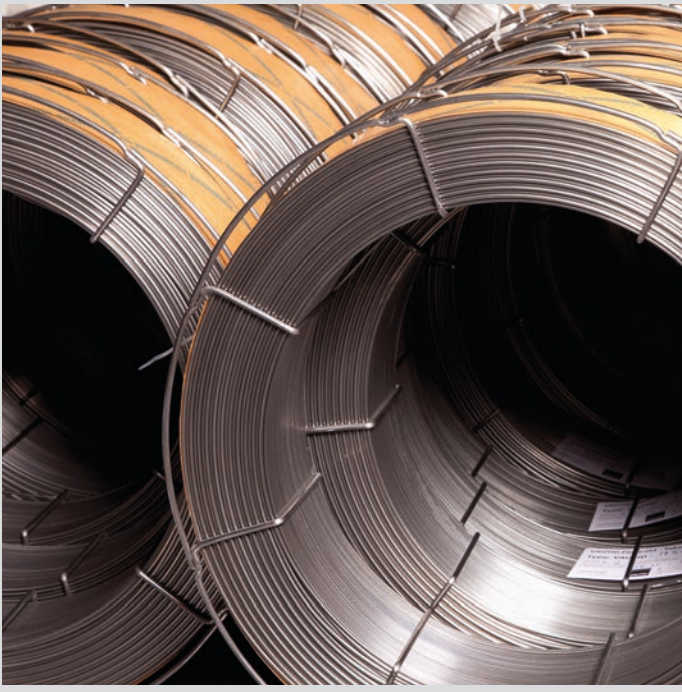
VAUTID tubular wire