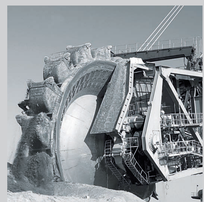
Crawler elements on excavator for open pit mining