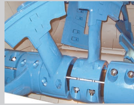
Mixing tools for double-shaft mixer