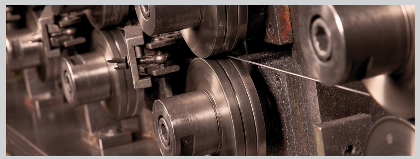
VAUTID tubular wire production