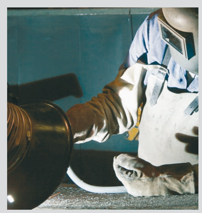
Manual hardfacing using VAUTID stick electrodes

Fields of application. Typical applications for VAUTID deposition welding materials include coating of mixing tools, hardfacing of excavator teeth, powder deposition welding of fan blades, hardfacing of bucket chain excavators and sinter crushers.