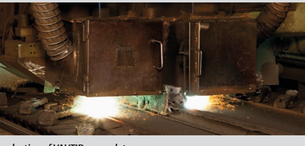
Production of VAUTID wear plates