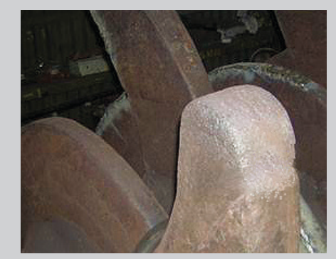
Sinter breaker star steel industry