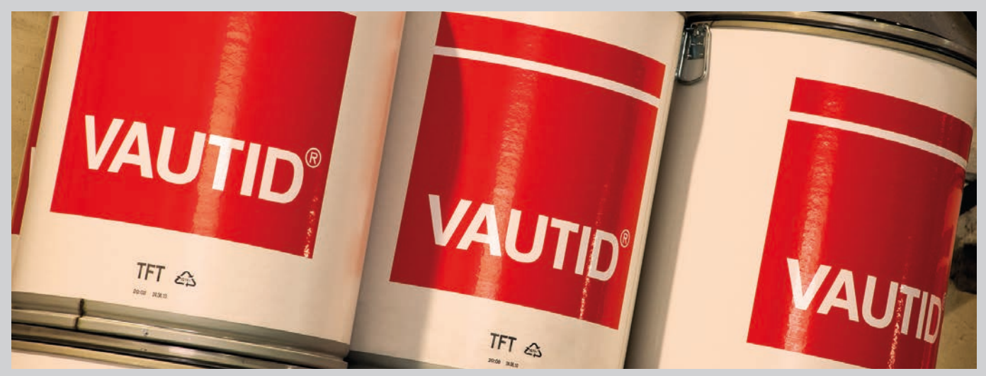
VAUTID tubular wire (barrels)