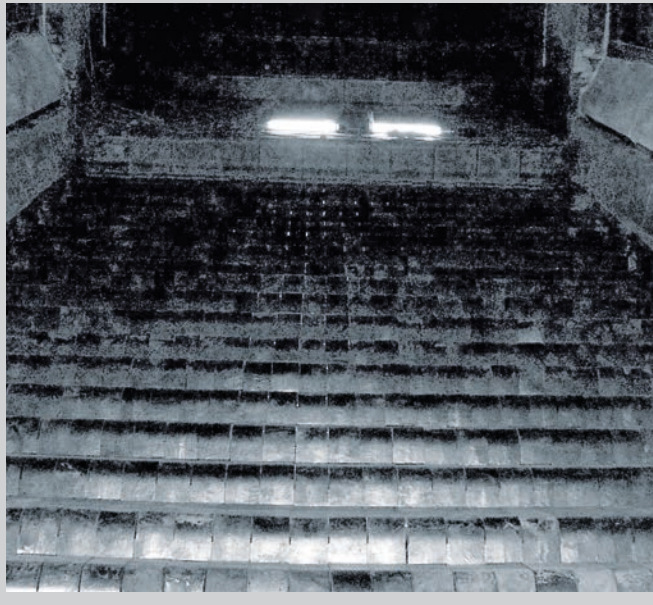
Grate bars in waste incineration