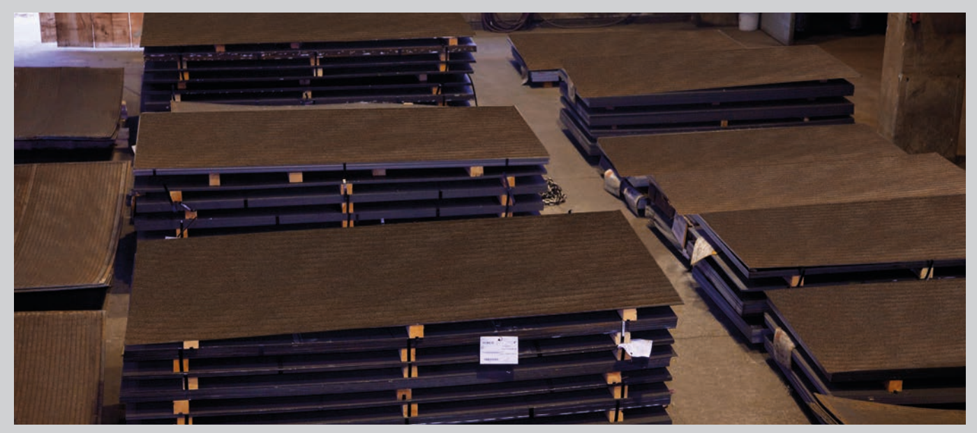
VAUTID wear plates