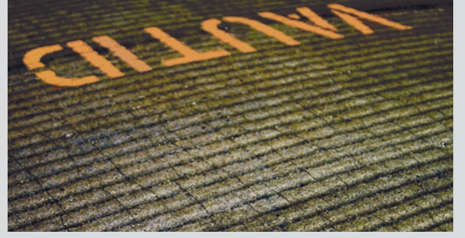
VAUTID wear plate